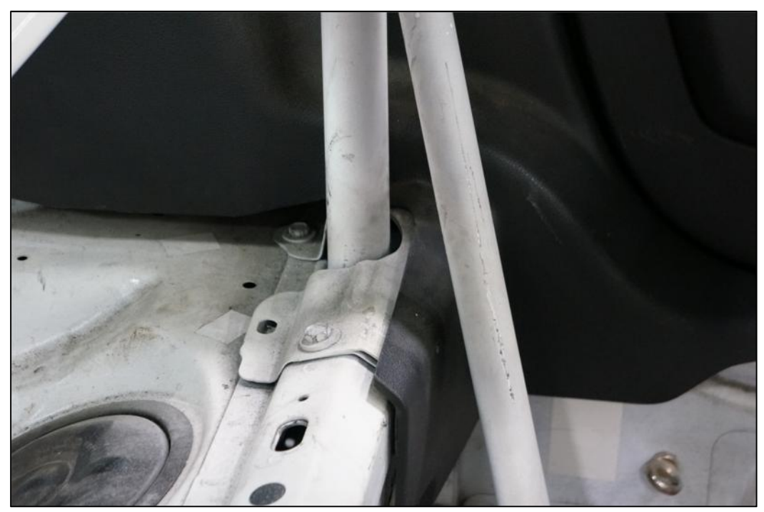
Main hoop at Boot (rear seat forward riser).