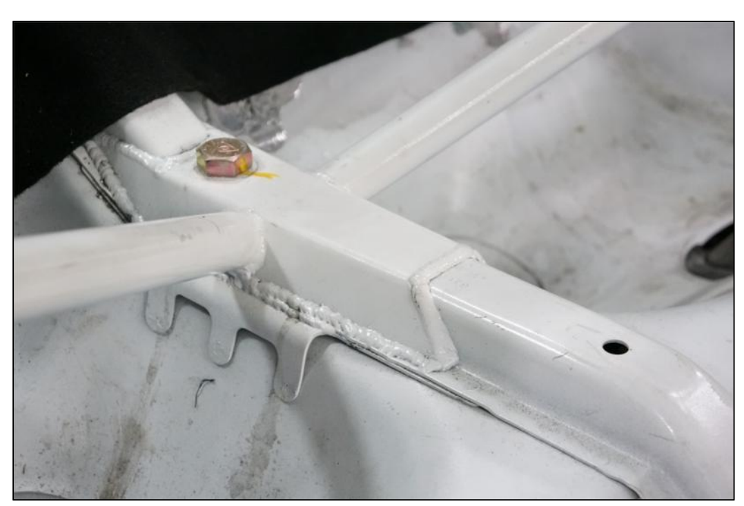
Rear tubes (#11 & 13) at center brace.