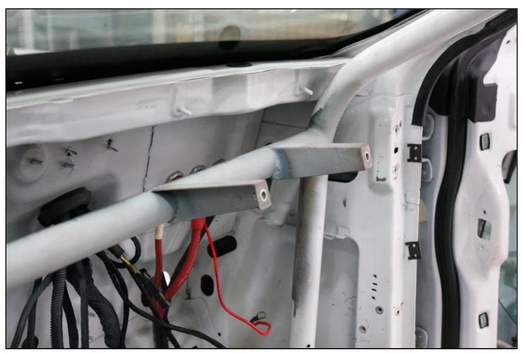
Passenger side dash brackets.