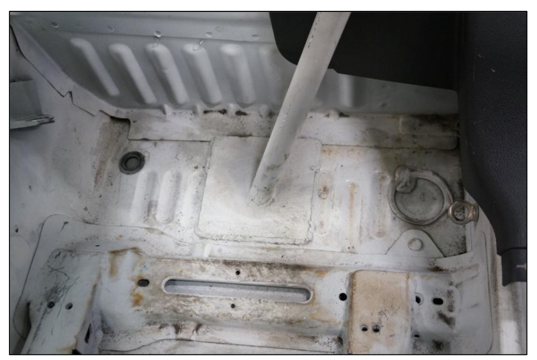
Tubes 10 & 14 at floor behind front seats.

Thank you for choosing Watson Racing products! If you have any technical questions or comments, please call us at: 855-WATRACE (928-7223).