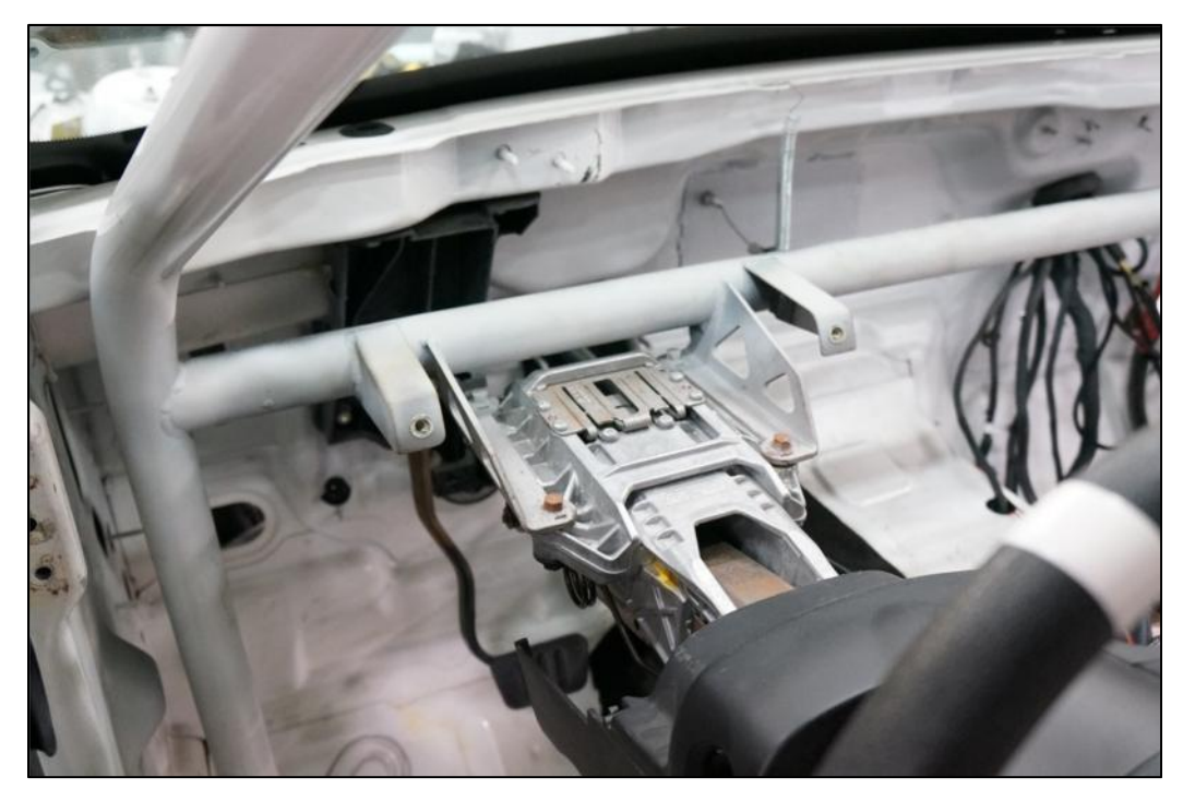
Dash & steering column brackets.