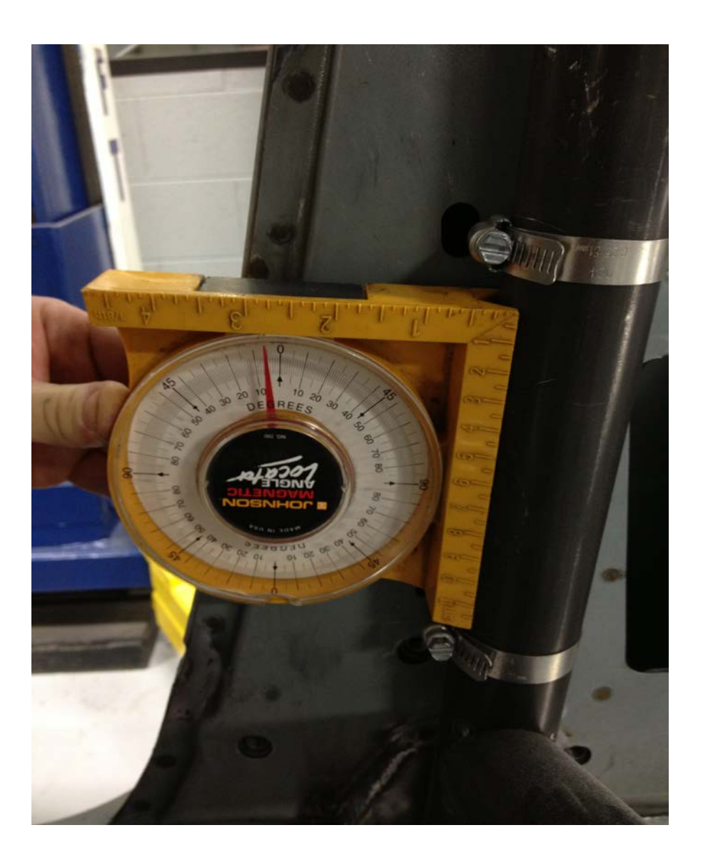
Shown above: Set main hoop tube number 7 at approximately 6.5°