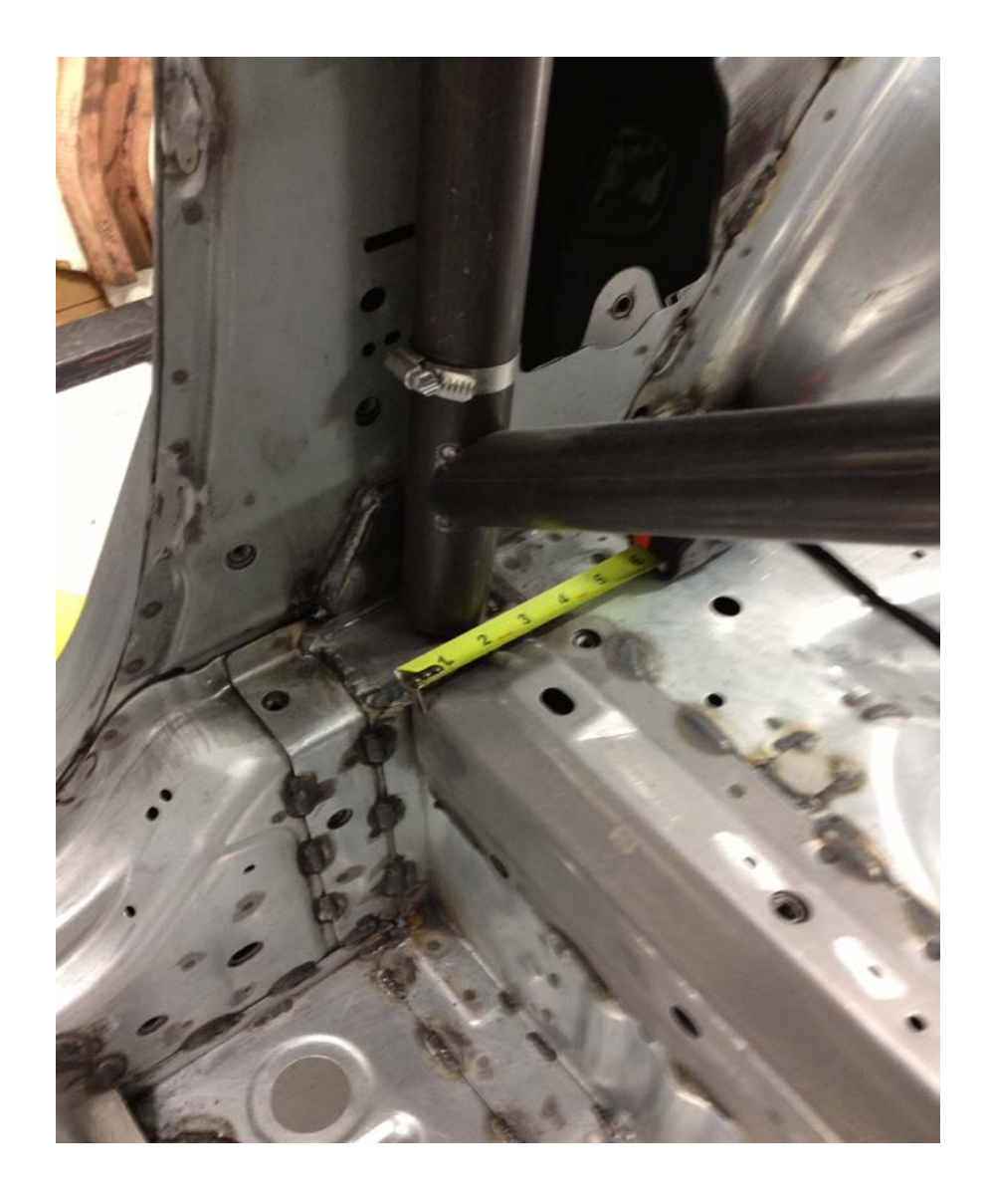
Shown above :Set main hoop tube number 7 about 2" on center from the face of the rear seat bulkhead