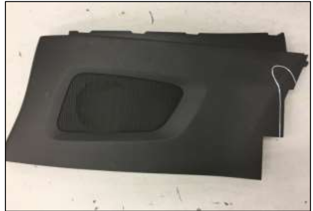
Upper plastic trim (white line)