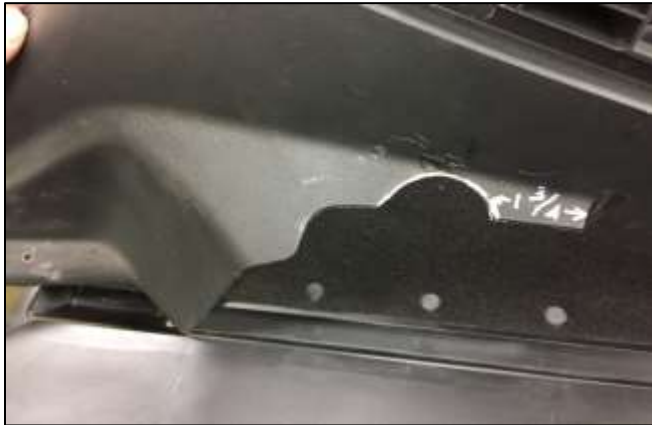
Lower plastic trim (white line)