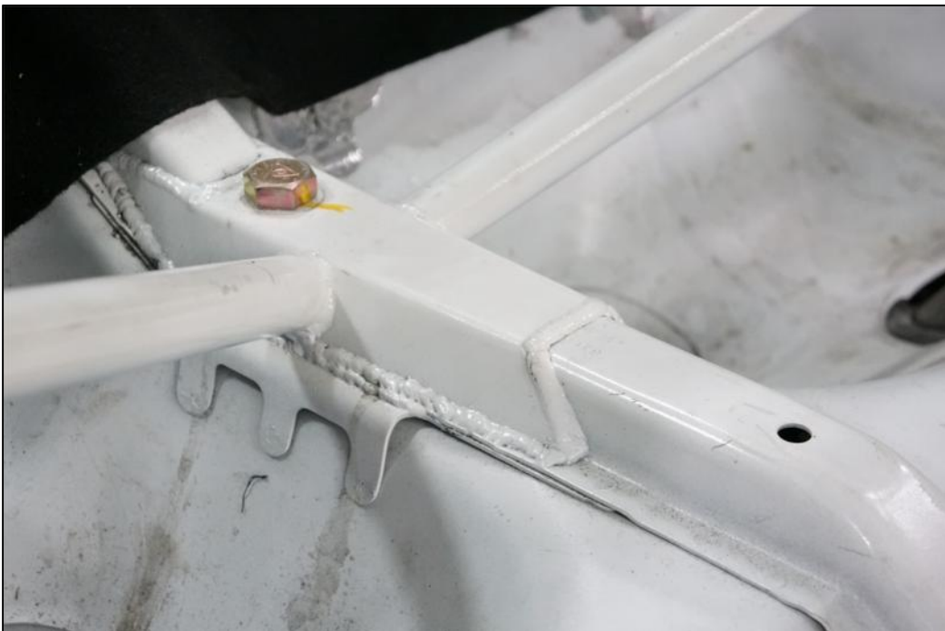
Rear tubes (#11 & 13) at center brace.