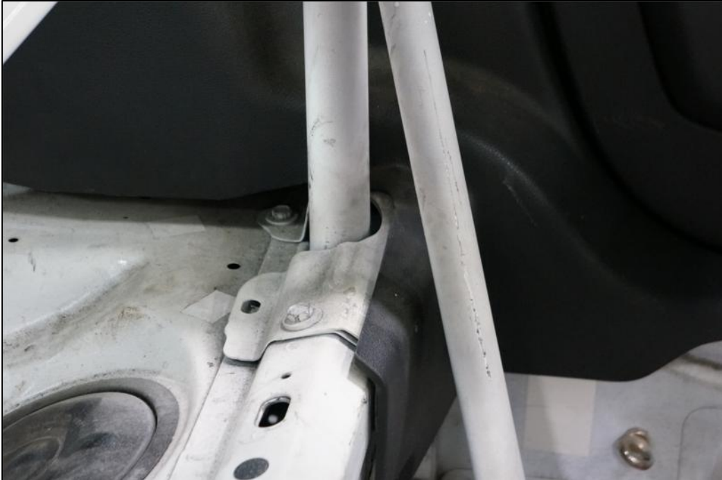
Main hoop at Boot (rear seat forward riser).