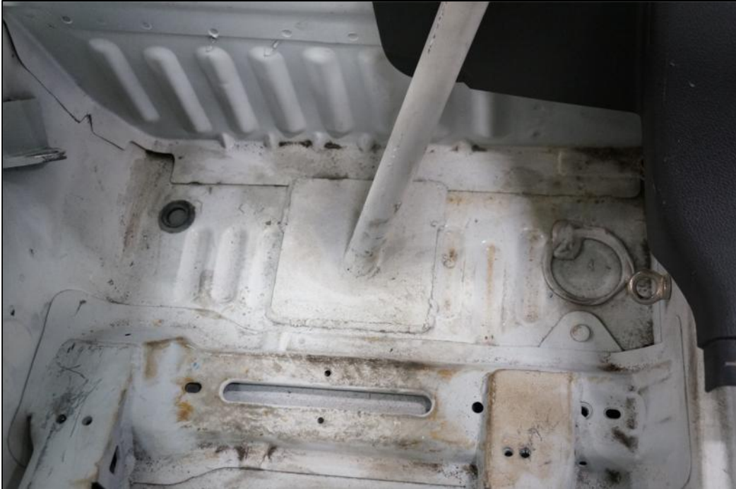
Tubes 10 & 14 at floor behind front seats.

Thank you for choosing Watson Racing products! If you have any technical questions or comments, please call us at: 855-WATRACE (928-7223).