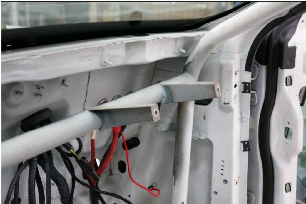
Passenger side dash brackets.