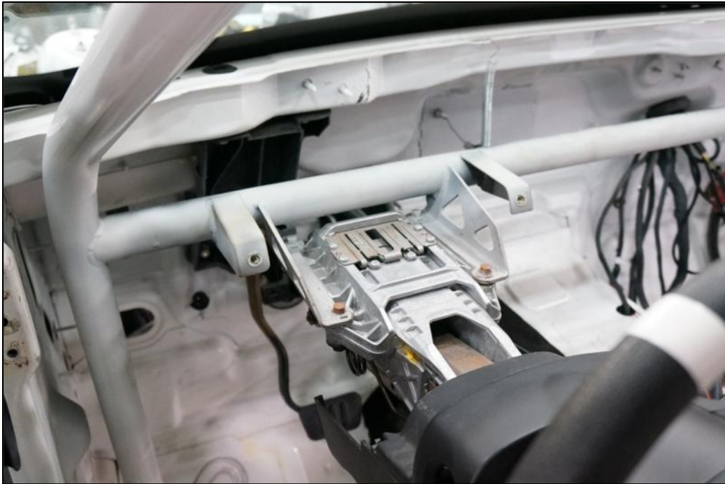
Dash & steering column brackets.