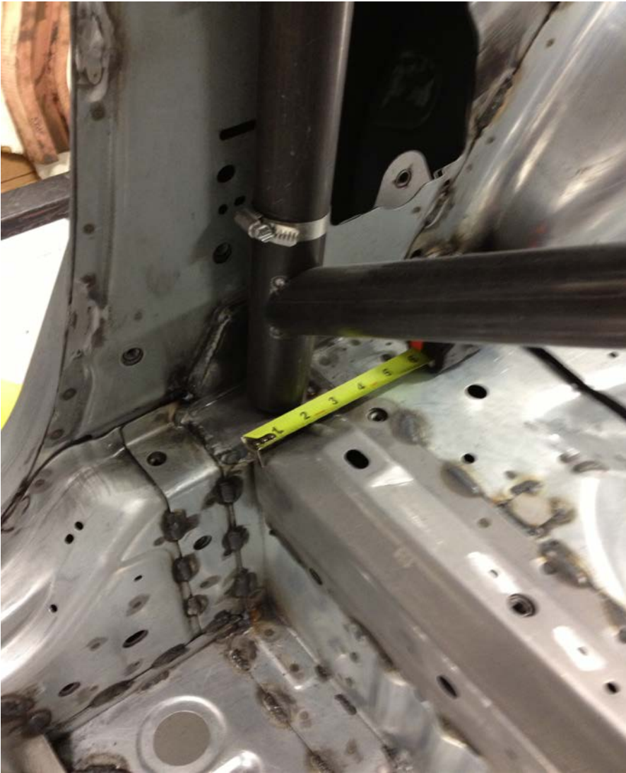
Shown above :Set main hoop tube number 7 about 2" on center from the face of the rear seat bulkhead