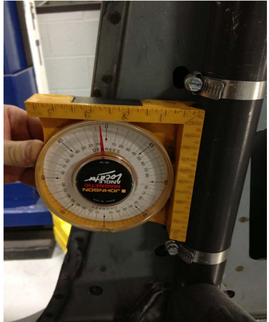
Shown above: Set main hoop tube number 7 at approximately 6.5°

All measurements are for reference only.